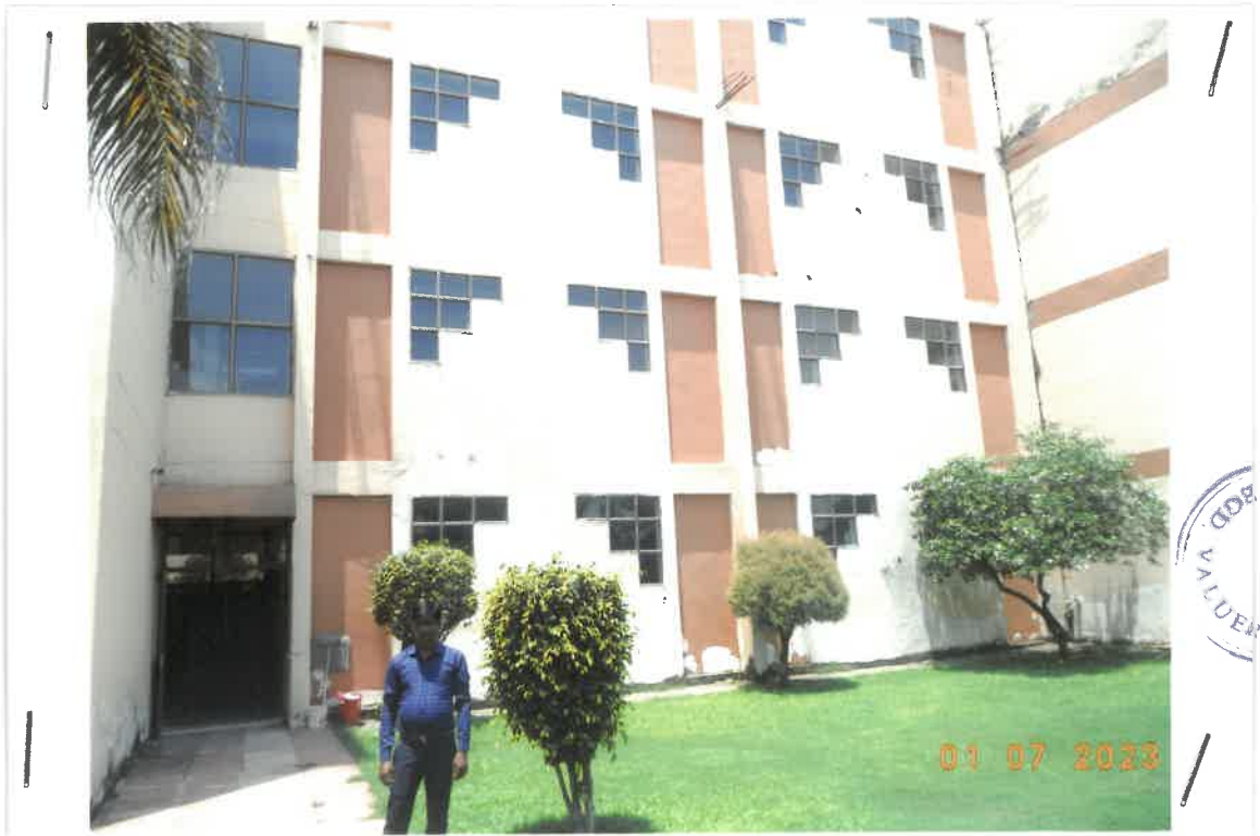
Back side of the School building